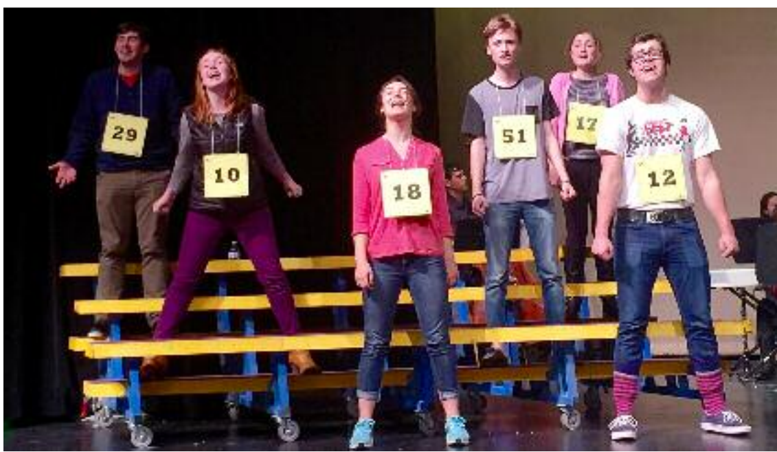
Miramonte High School cast rehearse for "The 25th Annual Putnam County Spelling Bee," which opens with a special show tomorrow at 4 p.m.

Music Departments present this year's musical, "The 25th Annual Putnam County Spelling Bee." This zany, hilarious production is never the same show twice due to actor improvisation and volunteer spellers from the audience. It also has some poignant moments showing the pressures young children often face to compete